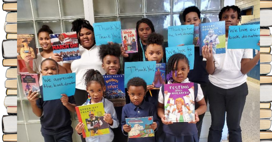
General George Patton School students share messages of appreciation